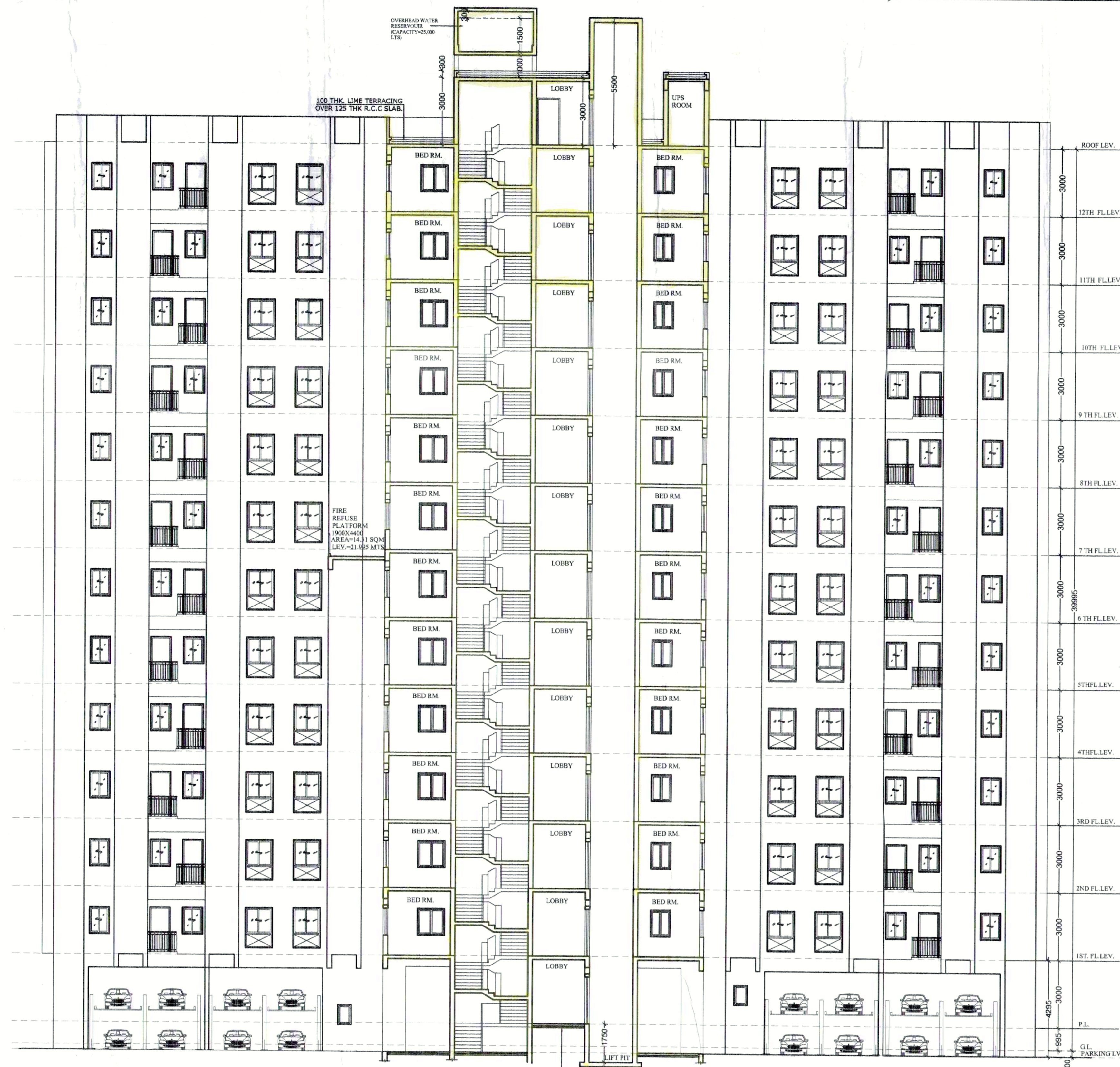
SECTION = B-B